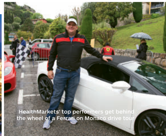
HealthMarkets' top performers get behind the wheel of a Ferrari on Monaco drive tour

► EVENT: HealthMarkets Insurance Agency Annual Conference