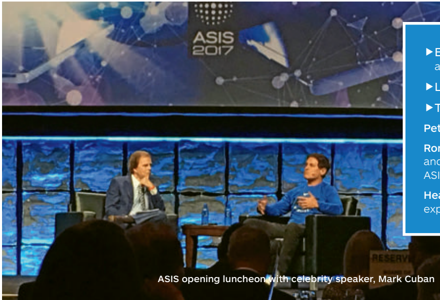
ASIS opening luncheon with celebrity speaker, Mark Cuban

► EVENT: ASIS International Annual Seminar and Exhibits