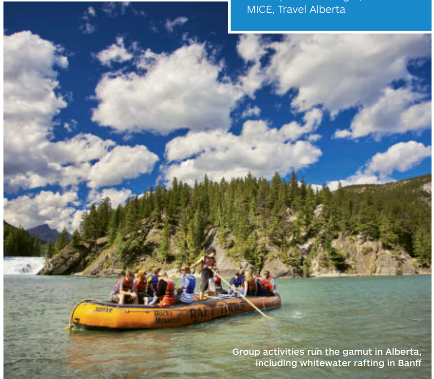
Group activities run the gamut in Alberta, including whitewater rafting in Banff