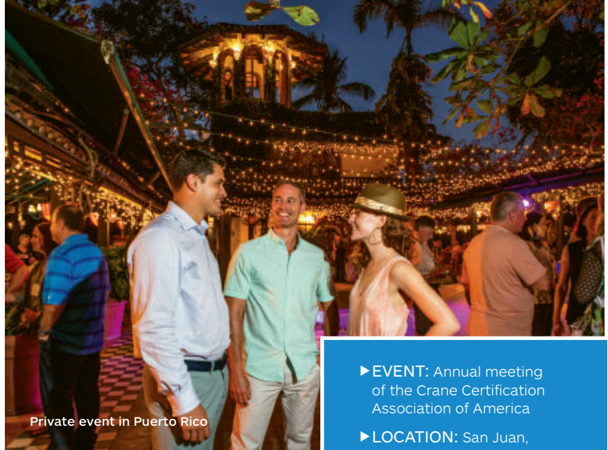
Private event in Puerto Rico