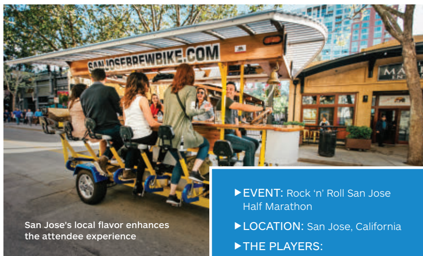
San Jose's local flavor enhances the attendee experience

with public relations and marketing services, by providing web placements, banner ads, hosting press events and distributing media releases."