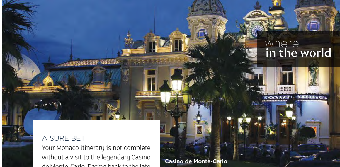
Casino de Monte-Carlo

From its perch on the Riviera coastline, Monaco is a mecca for water sport activities for the seafarers in your group. Participate in a rowing or sailing regatta at the Societe Nautique, or have the SailXTeam at the Yacht Club de Monaco rally your team with a sailing lesson that bolsters cooperation, communication and solidarity. Visiting in September? Check out 120+ of the world's most remarkable superyachts at the annual Monaco Yacht Show. yacht-club-monaco.mc