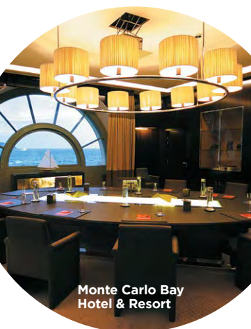
Monte Carlo Bay Hotel & Resort

DMCs: Lafayette Group lafayette-travel.com , Pacific World pacificworld.com , Raising Stones Events raising-stones-events.com